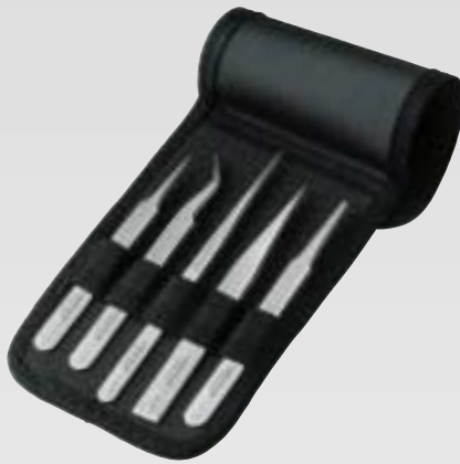
General purpose tweezer set, 5 pcs