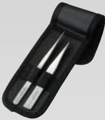
Fine tip tweezer set, 2 pcs