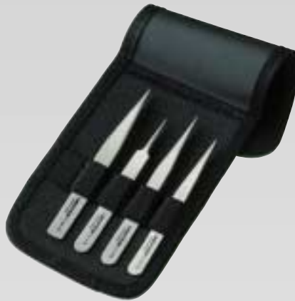
Titanium tweezer set, 4 pcs