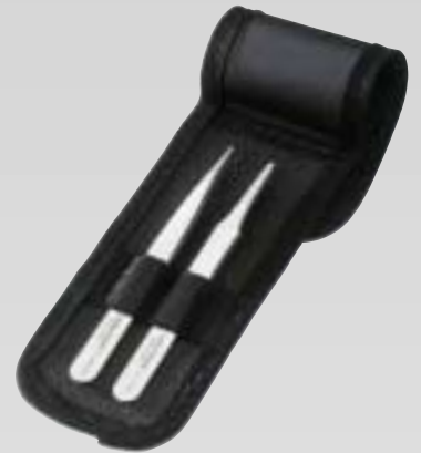
Strong tip tweezer set, 2 pcs