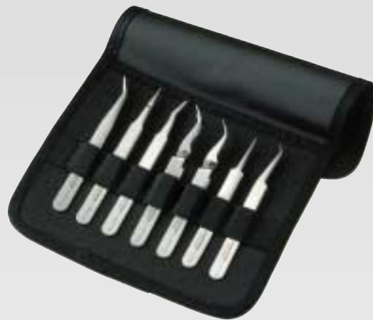
SMD tweezer set, 7 pcs

Since 1856, Lindstrom has developed and refined precision hand tools to perfection. Our tweezers offer optimal balance, tip alignment, and symmetry as well as a wide variety of materials and designs to meet the most sophisticated and demanding requirements.